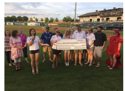
Mudbug Ball Committee check presentation

Thank you to all who supported this wonderful event by buying tickets and offering sponsorships. A BIG thank you to our returning ‘Belle of the Ball’ Sponsor, Capital Container!